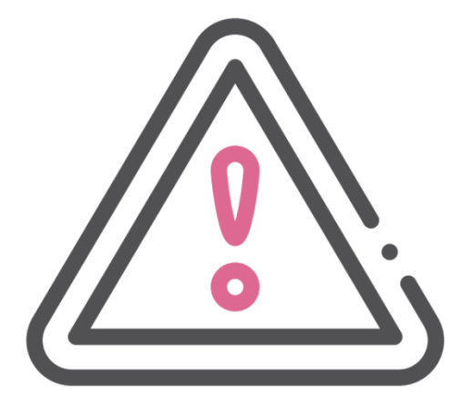
1st NHS Trust to declare a